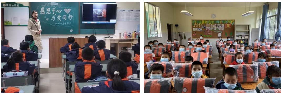
Winter Jacket Donation Ceremony

The donation ceremony was held through the theme class meeting throughout the school. Due to the impact of the epidemic situation, volunteers of Bangkok Bank China were unable to go to the school to interact with students in person. Colleagues from the Head Office, Beijing Branch, Shenzhen Branch, Chongqing Branch and Xiamen Branch prepared their own blessing videos and cards. In addition to the bank staffs, their children also joined the activity as volunteers. Through the videos, they conveyed their love and care for the left-behind children, encouraged them to study hard, grow up healthily, understand self-respect, self-confidence, self-improvement and self-reliance, set goals and forge ahead bravely.