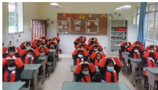
Students Expressed Their Gratitude